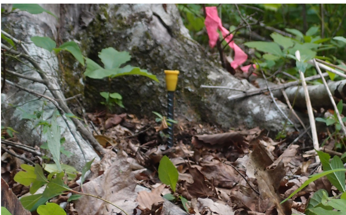
Markers used to identify monitoring plots for the forest inventory.