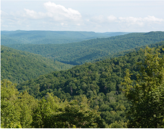
View of the Shafer-Tuuk forest project.