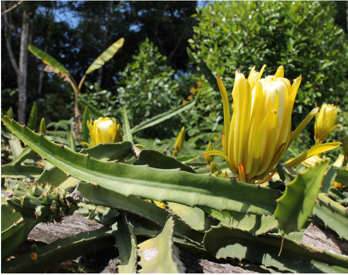
Diversification of agricultural crops.