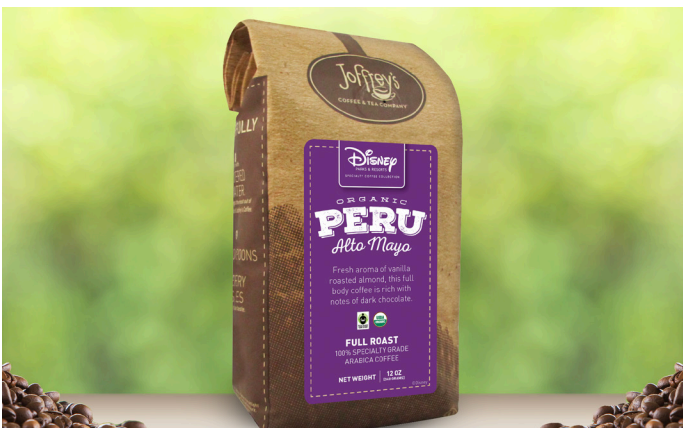
Alto Mayo specialty blend coffee.