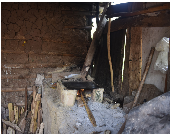
Rudimentary traditional cook-stoves are generally inefficient and in need of replacement.