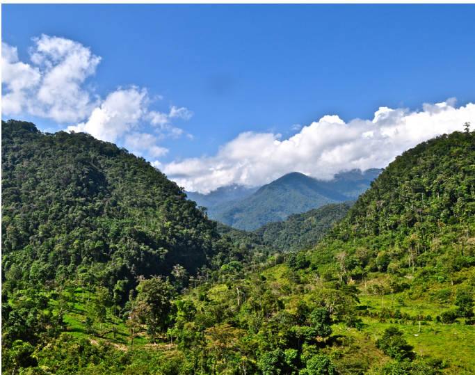
Alto Mayo Protected Forest.