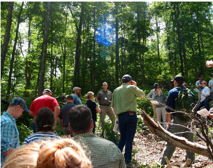
Field visit to discuss improved forest management benefits.