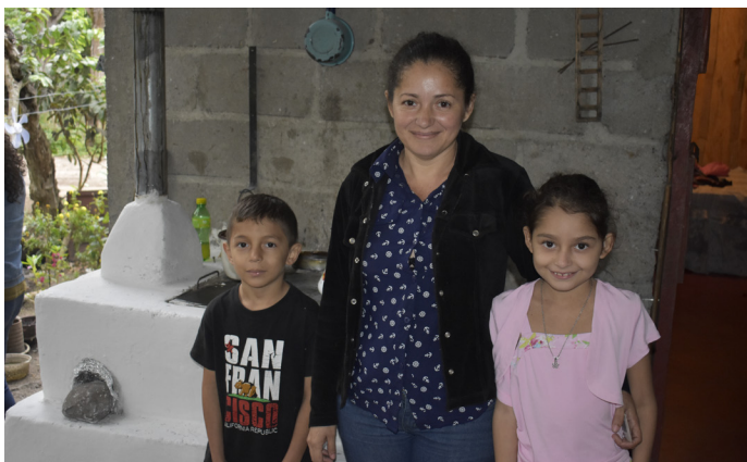
Family with new efficient cook-stove.