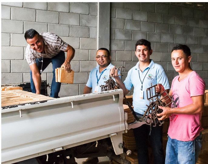
Cook-stove materials are locally sourced