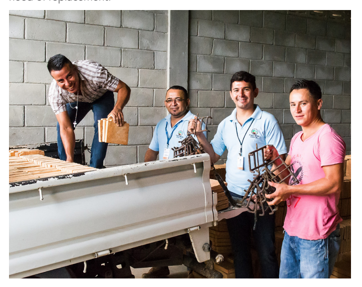
Cook-stove materials are locally sourced