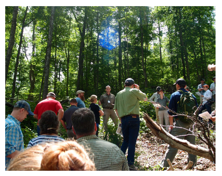
Field visit to discuss improved forest management benefits.