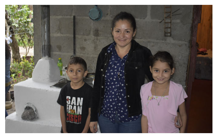
Family with new efficient cook-stove.