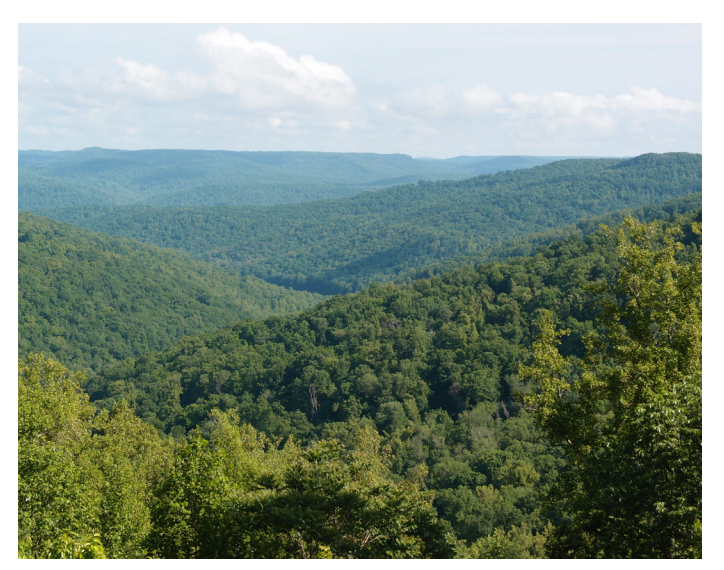
View of the Shafer-Tuuk forest project.