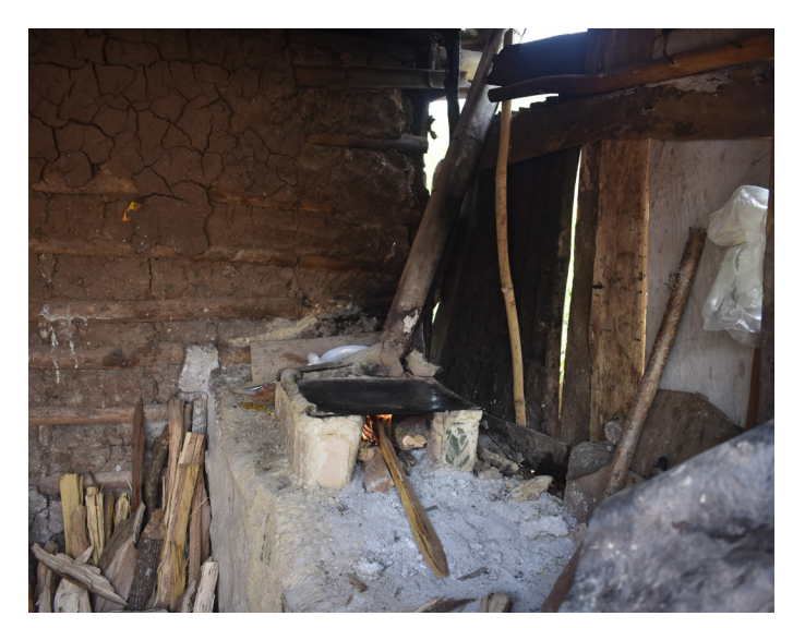
Rudimentary traditional cook-stoves are generally inefficient and in need of replacement.