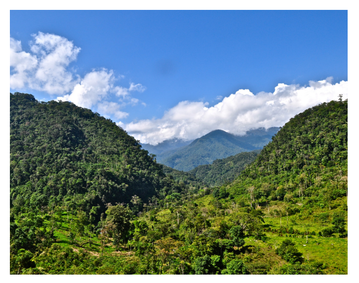
Alto Mayo Protected Forest.