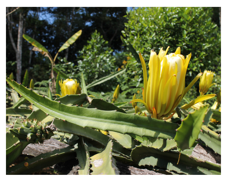
Diversification of agricultural crops.