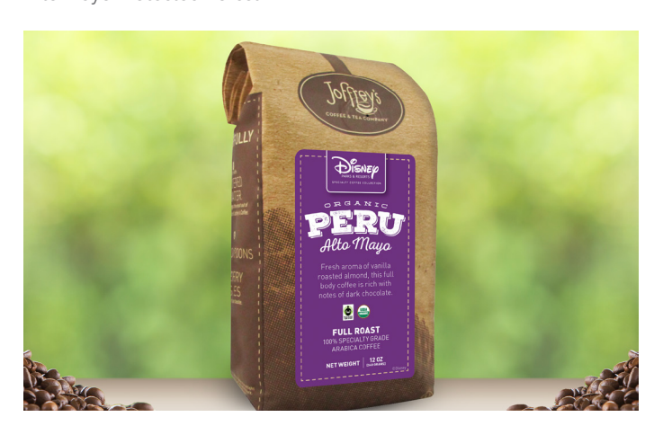
Alto Mayo specialty blend coffee.