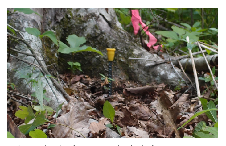
Markers used to identify monitoring plots for the forest inventory.